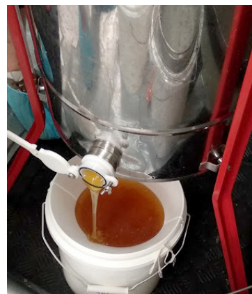
The honey flowing out of the extractor after the frames have been spun and the honey has come out of the frames.