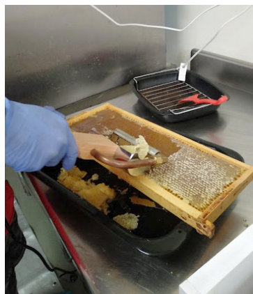
Removing the wax layer that the bees make to cover the honey and protect their honey.